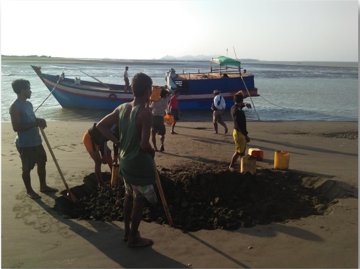
Sand mining at Nanthar Island