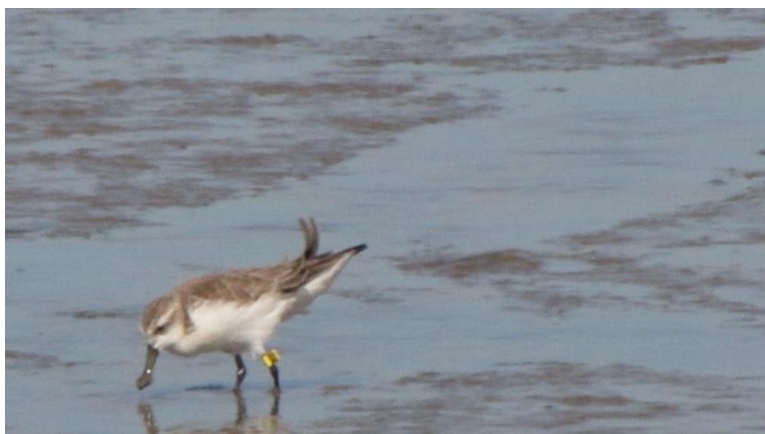
SBS with yellow flag (CU)

RBANCA team conducted surveys on Nanthar Island from 21 th of November 2016 to 25 th of November. The team left Sittwe at 10am and made their way by car to Yae Chan Byin jetty where they arrived at 10:40am. From there, the team took a boat to Aung Daing and Pa Lin Byin security police camp, arriving at 12pm. At 8:00am on the morning of 21 st November, the team took a boat to Nanthar Island, arriving at 9:30 am and began surveys at 10am. During the survey, 4 Spoon-billed Sandpiper (SBS) were observed, two of which were flagged. One was flagged with number 27 on a light green flag and the other was a yellow flag with the letters 'CU' written. At 3:30pm on the same day, 5 SBS without rings were recorded. Surveying began the next day at 8:00am, recorded another 11 SBS. On 23 rd November, surveying began again at 8:30am, where the team recorded 12 SBS and two Painted Storks. On 24 th November, survey started at 8:30am where 14 SBS were recorded including 8 Asian Open-billed. The team surveyed on the last day began at 7:30am and 7 SBS without flag were recorded.