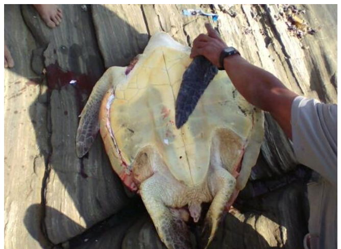
Dead sea turtles