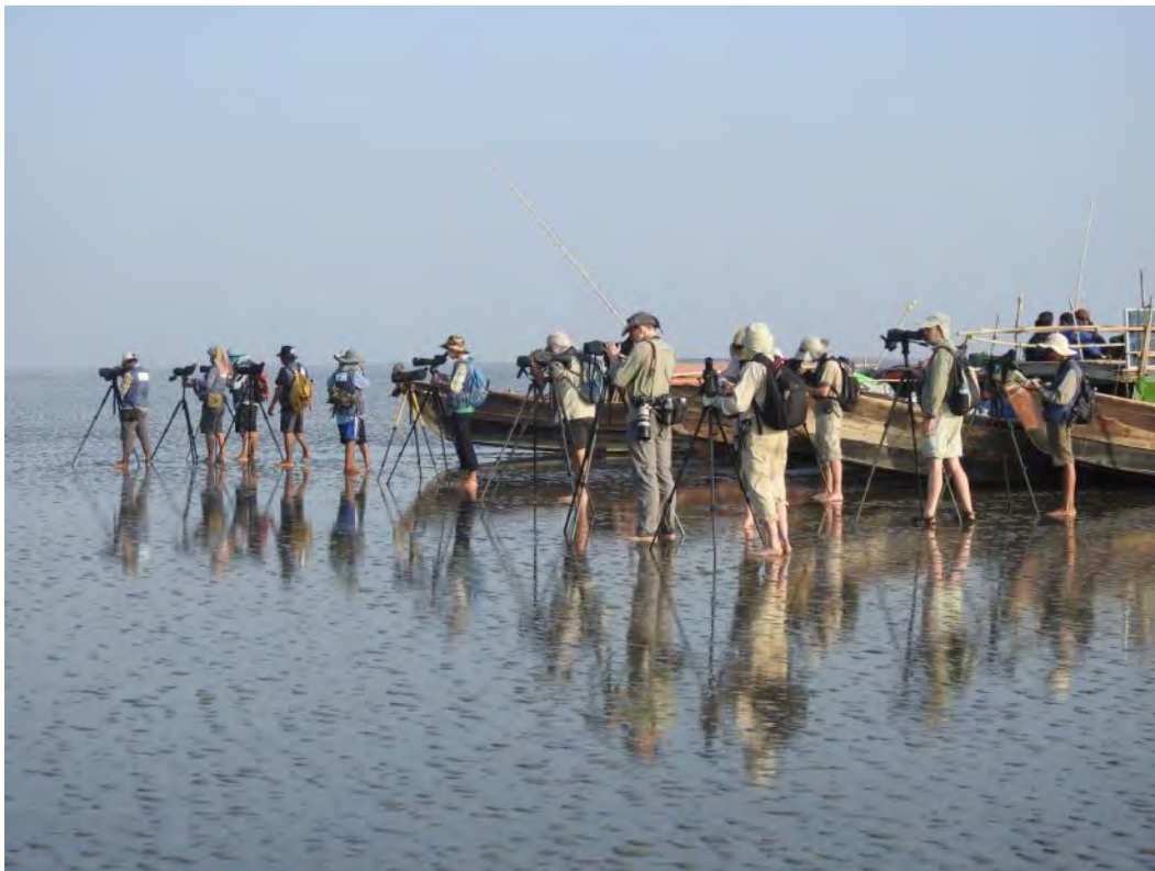
Survey Team at the Gulf of Mottama