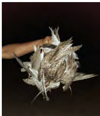
Shorebirds in nets (Nanthar Island)