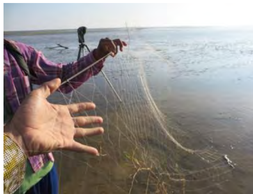
Bird catching net (Left and Right) in Kyuntharyar (Gulf of Mottama)