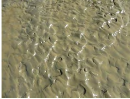
Habitat of the Spoon-billed Sandpiper (Left and Right)