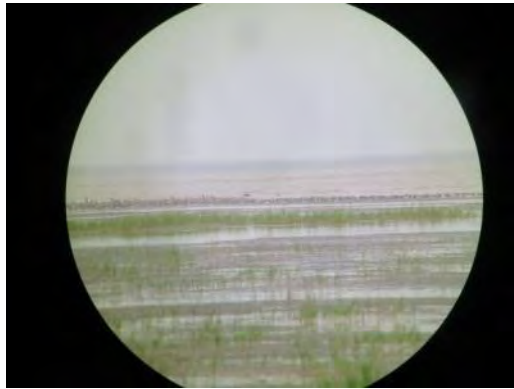
Flocks of the Shorebird in the Gulf of Mottama (Left and Right)