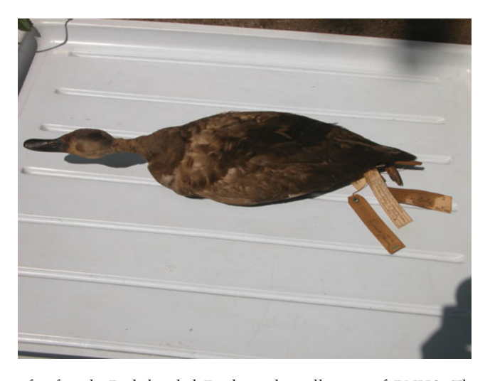
Figure 3. Skin of a female Pink-headed Duck in the collection of BNHS. The specimen was collected at Koolay, near Singu, in present-day Mandalay division, on 25 December 1908.

The second specimen from Myanmar is a male acquired from Mandalay bazaar in February 1910 and held at the American Museum of Natural History (AMNH) (Figure 4). The label of this specimen bears the following information: "O, Mandalay bazaar, 10.02.10, H. H. Harington". This represents the last confirmed record of the species from Myanmar. Mandalay (21°58′30″N, 96°05′00″E; 80 m a.s.l.) is c. 60 km south of Singu town.