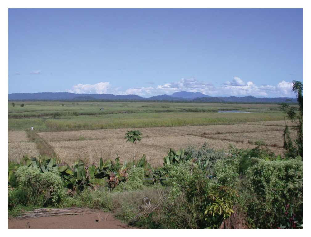
Figure 5. Nawng Kwin wetland, Kachin State. The photograph is taken from the point from where a possible sighting of Pink-headed Duck was made in December 2004.

p. haringtoni, the most widespread subspecies of Spot-billed Duck in South-East Asia. It does not, however, rule out another subspecies, A. p. zonorhyncha, which has very reduced white in the tertials, and which was recorded in the lowlands of Kachin state during the November–December 2004 survey (Tordoff et al. in press).