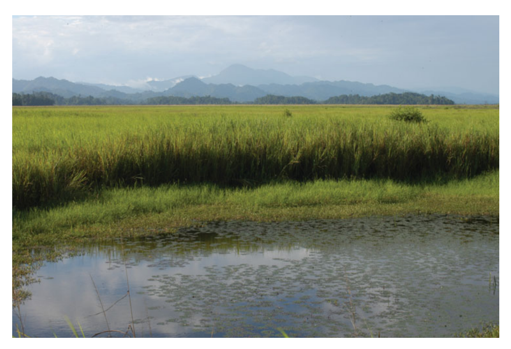
Figure 7. Kamaing area, Kachin State. The photograph shows one of the large grasslands studded with pools near the Nat Kaung river.

On 16 October, the survey team received a report from Poh Sa, a farmer along the Nat Kaung river, who reported that, in September–October 2004, while looking for rubies near Za Baw